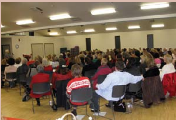
An Alumnae Event